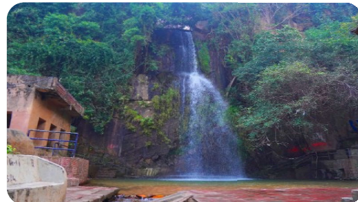
KAKAOLAT WATER FALLS