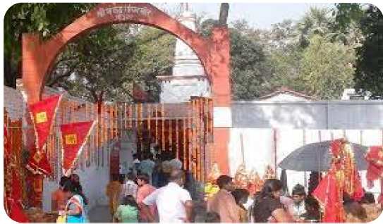
SANKAT MOCHAN MANDIR