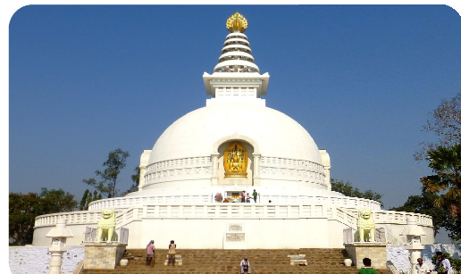
VISHWA SHANTI STOOP, RAJGIR