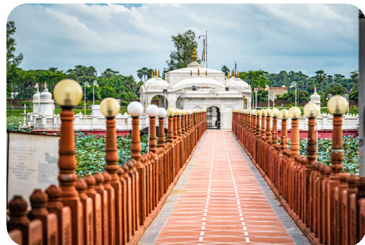
JAL MANDIR, PAWAPURI