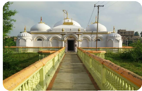
GUNAWAN JAL MANDIR