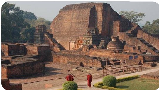
NALANDA KHANDHAR, NALANDA